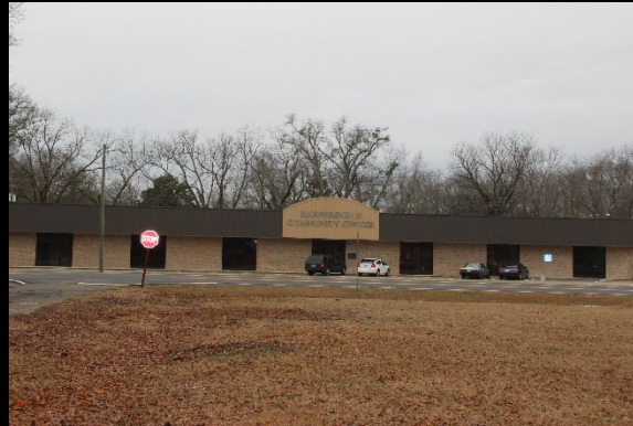
Harpersville Community & Senior Center