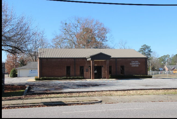
Calera Community Center