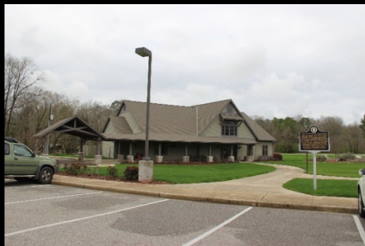
Alabaster Senior Center