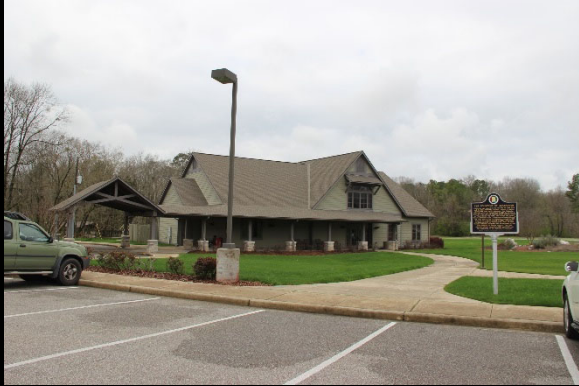
Alabaster Senior Center