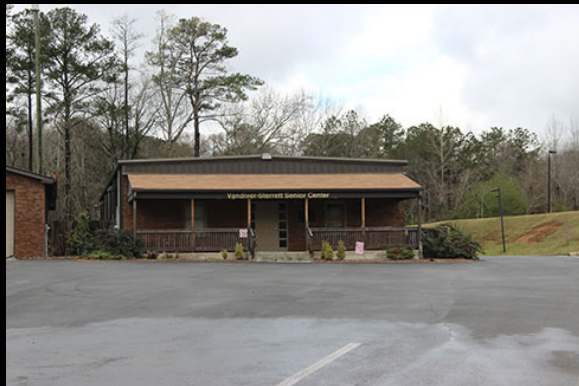
Vandiver-Sterrett Senior Center