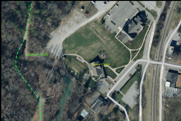
Buck Creek Greenway