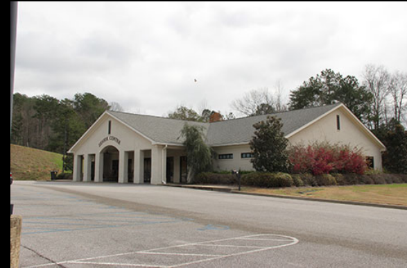
Pelham Senior Center