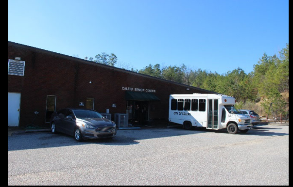
Calera Senior Center