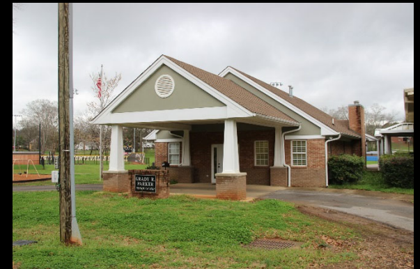
Montevallo Senior Center