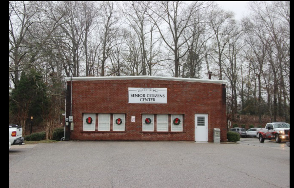
Helena Senior Center