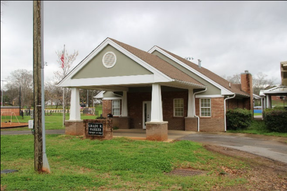
Montevallo Senior Center