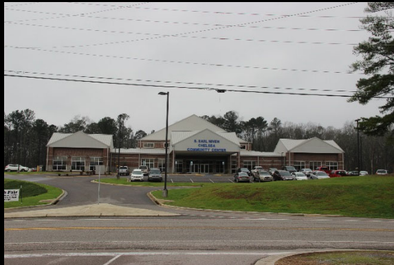
Chelsea Community Center