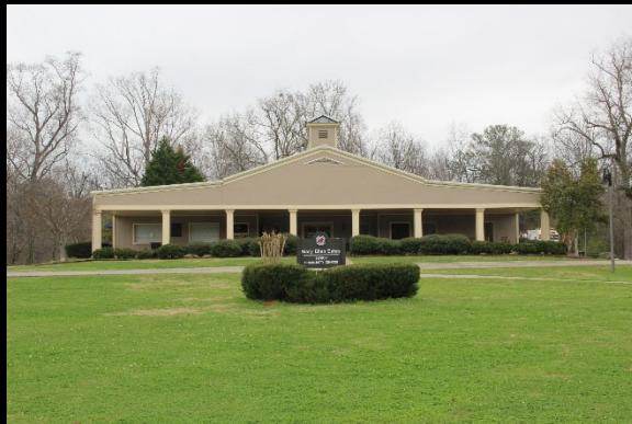
Heardmont Senior Center