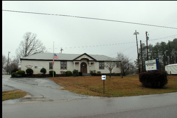
Pea Ridge Senior Center