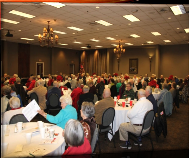
RSVP Volunteer Brunch