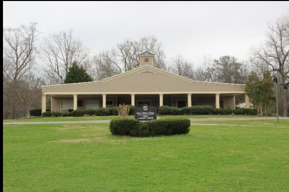
Heardmont Senior Center