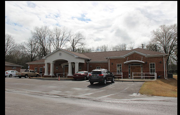
Columbiana Senior Center