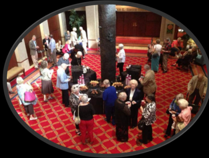
Seniors Visit to McWane Science Center