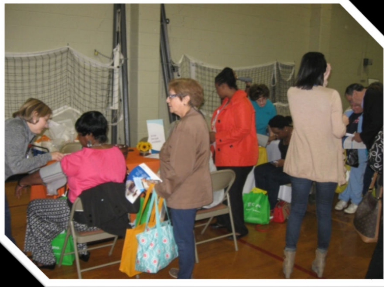
Senior Health & Wellness Exhibition