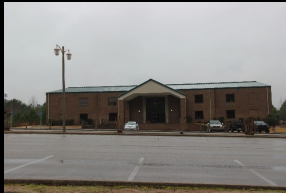
Helena Community Center