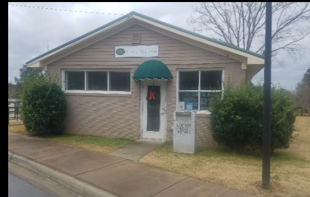
Westover Senior Center